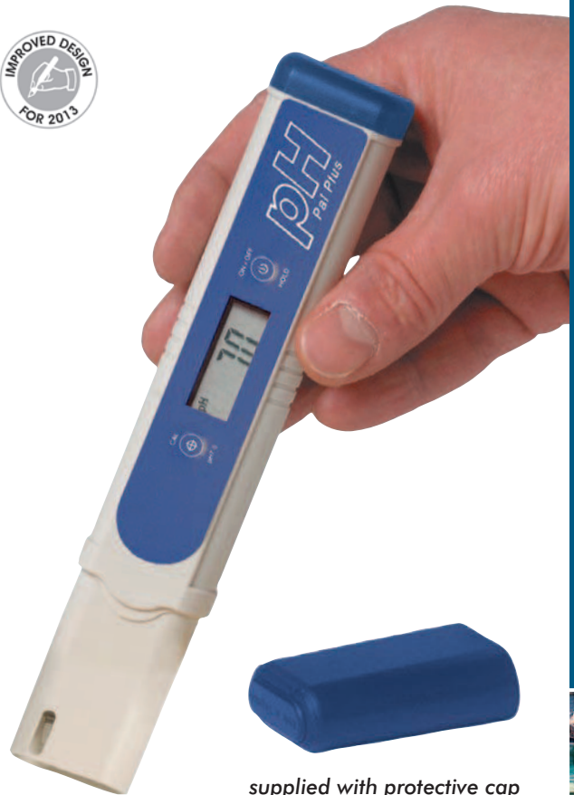
supplied with protective cap